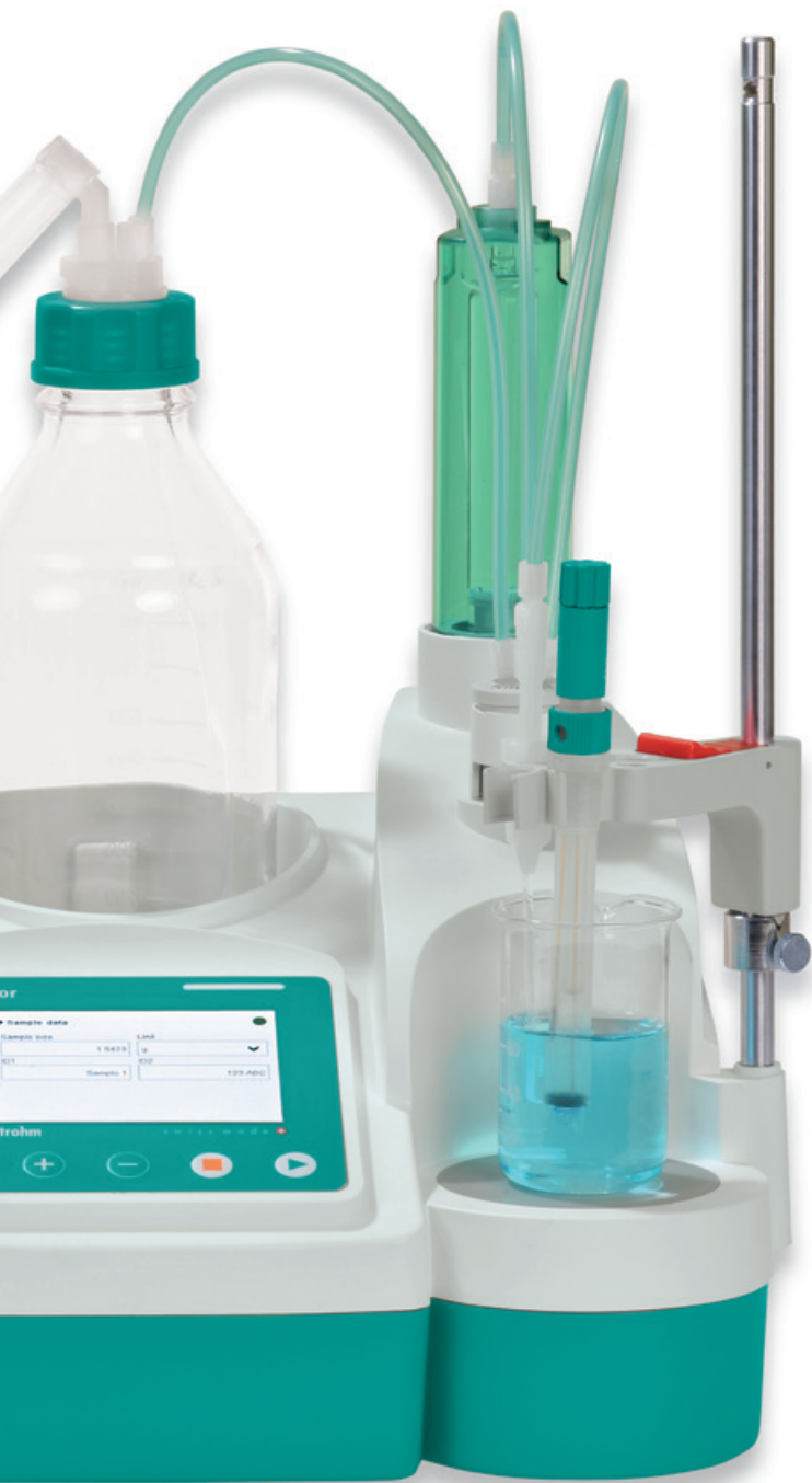
Compact design: just 28,6 cm (w) x 28,6 cm (d) x 22,0 cm (h)